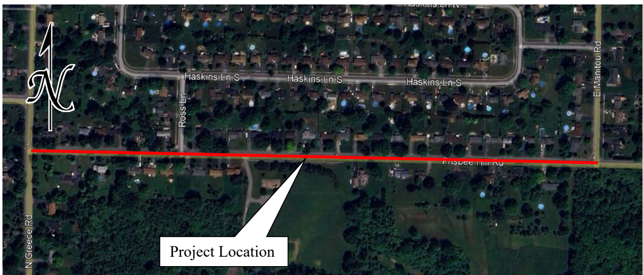
Intersection of North Greece Road (County Road 144) and Frisbee Hill Road (County Road 107) to the intersection of Frisbee Hill Road (County Road 107) and E. Manitou Road (County Road 140) (Above)